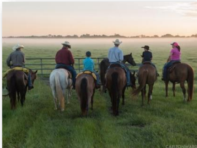
1 Equestrians enjoying access to Florida trails and open land.

Florida Forever is the state land acquisition program, managed through the Division of State Lands (DSL). The program purchases properties with high conservation value, purchasing both land outright and conservation easements on land. DSL often forms partnership arrangements with water management districts and county governments on conservation land acquisition.