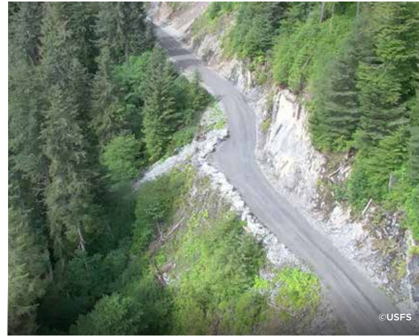
The Hoonah road system in the Tongass National Forest in Alaska was in desperate need of repair. The project resurfaced two Forest Service roads, removed roadside hazards, improved visitor access, restored the Bear Paw Lake Trail and the boardwalk at Wukuklook Trail and increased parking.