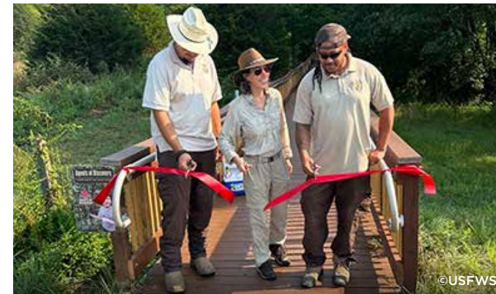
Project rehabilitated the Redington Boardwalk at Patuxent Research Refuge in Maryland after being closed for many years. Improvements to the boardwalk include new decking, handrails and benches.