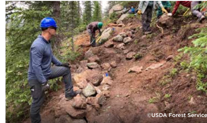
San Isabel National Forest in Colorado received funding to rebuild three miles of the South Fooses Creek Trail, a popular trail for mountain bikers, hikers and equestrians and rebuild the Monarch Park Campground.