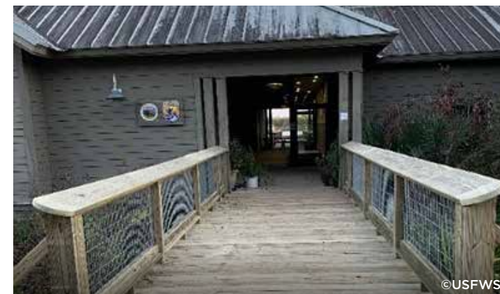
Project replaced main boardwalk and trail at Red River National Wildlife Refuge in Louisiana . Previous extreme weather events exposed the outer footing of the primary boardwalk and damaged a popular pedestrian trail making them unsafe for visitors.