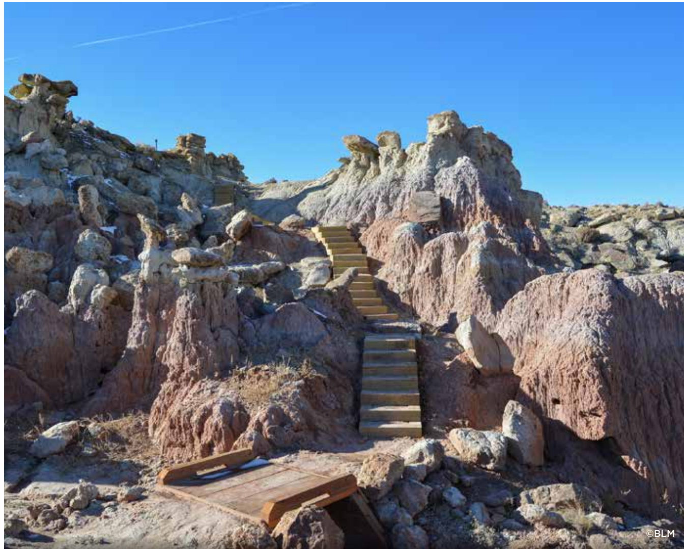
Project repaired the trail and boardwalk, replaced washed-out culverts and improved a parking lot and picnic areas at Gooseberry Badlands Scenic Overlook Trail in Wyoming . Improvements provide better safety for visitors and reduce annual maintenance costs.