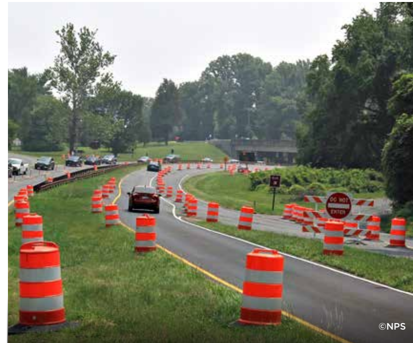
Project to reconstruct 7.6 miles of the George Washington Memorial Parkway in Virginia . The project is critical to improving the driving experience, safety, water drainage and the scenic views on the parkway. The George Washington Memorial Parkway is a commuter road that roughly 70,000 vehicles drive on daily.