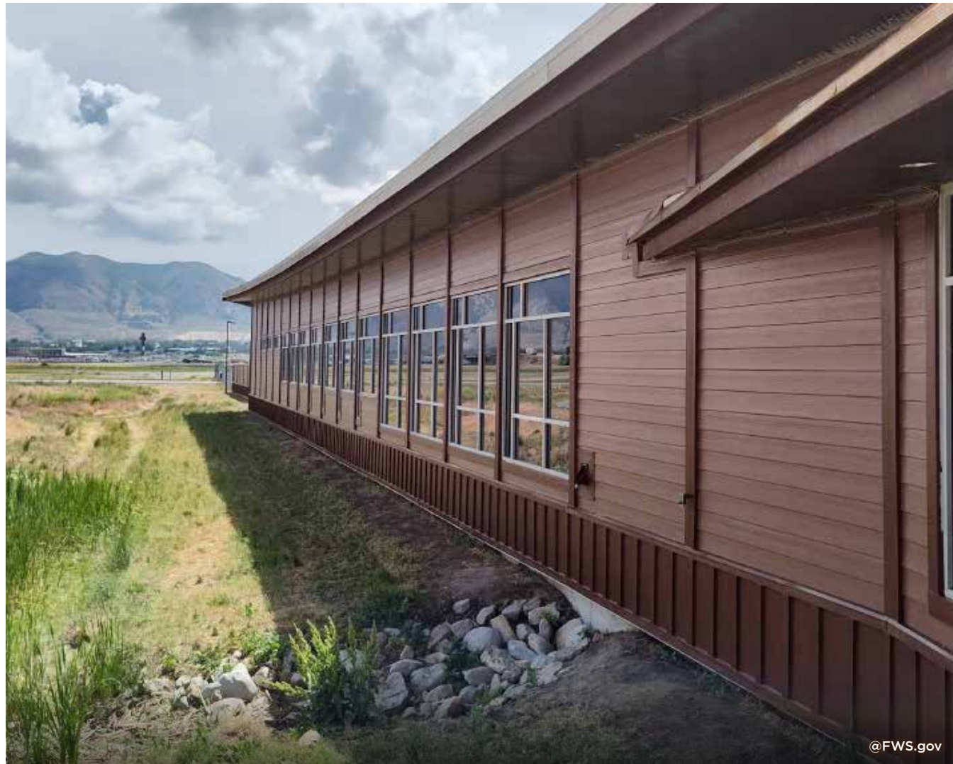
Rehabilitation efforts at Bear River Migratory Bird Refuge in Utah to improve water passage through the refuge and improve bird nesting habitat. Improvements also included roof and siding repair at the Bear River Wildlife Education Center.