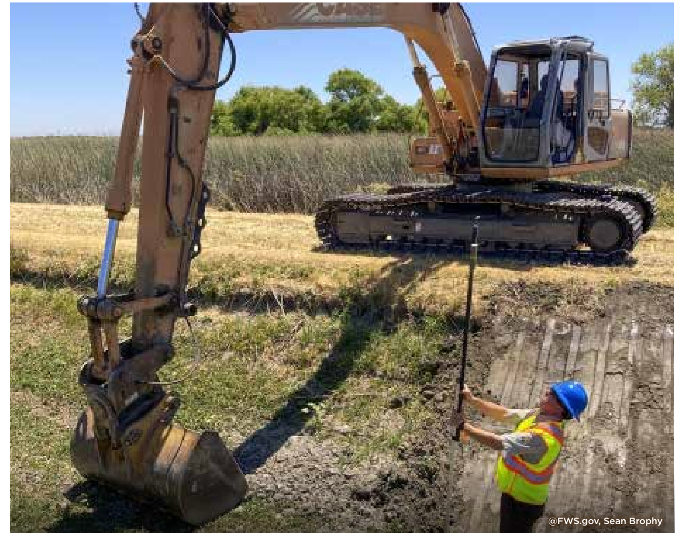
Restoration efforts to improve and replace aging structures that diverts water that no longer occurs naturally to the San Luis National Wildlife Refuge in California . Projects included cleaning, regrading and resloping ditches, replacing water structures and piping, and removing excess sediment. This land offers refuge to tule elk and many species of migrating birds.